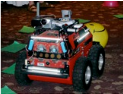
Using Phission, our ATRV-JR robot found the yellow beach ball at the AAAI-05 Scavenger Hunt competition. Phission can be used for object recognition and tracking, as well as image segmentation.

Phission is a concurrent cross-platform, multiple language vision system software development kit (SDK). The SDK constructs a processing sub-system for computer vision applications. Phission abstracts low-level image capture and display primitives, which allows researchers to focus on their primary work.